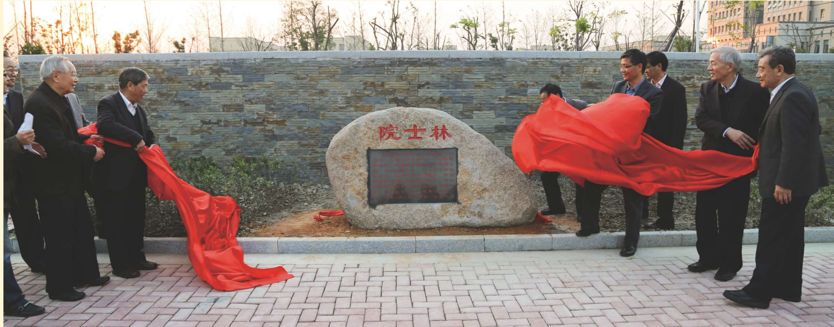
五位院士与学校、诸暨市和学院主要领导为“院士林”揭牌 The Unveiling Ceremony of “Academicians Grove” by Five Academicians, University and Municipal Government Leaders