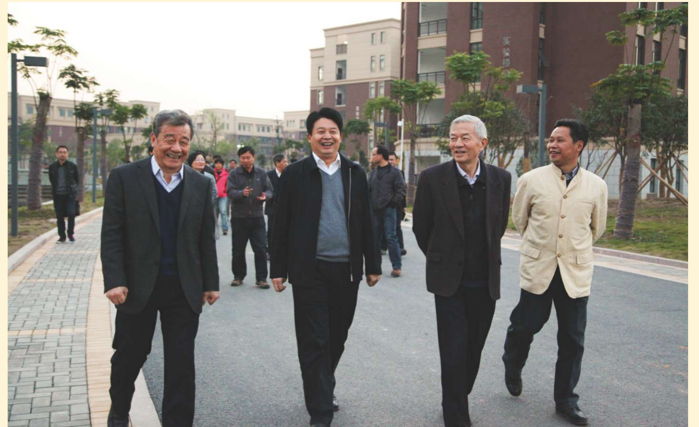
院士参观校园 Academicians visit campus