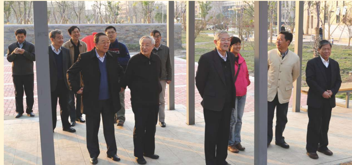
五位院士察看“院士林”地址 A Field Visit of Academicians Grove